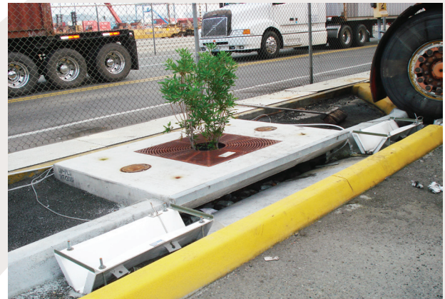
Filterra™ monitoring unit at a port.

Filterra is well-suited for the ultra-urban environment with proven high removal efficiency for many toxic substances such as petroleum and heavy metals.